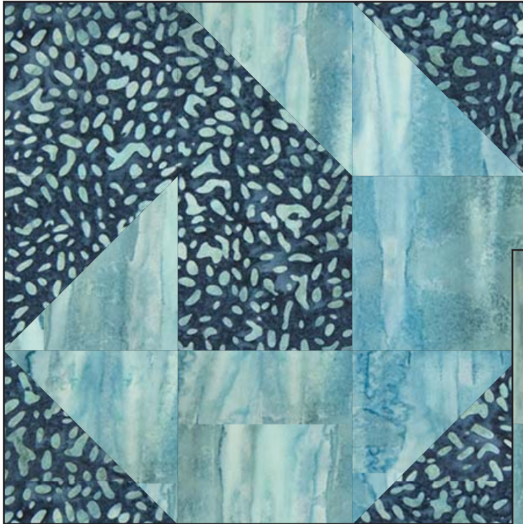
Blocks shown in Ketan and Brush Strokes Ketan - 81000-627 | Brush Strokes - 81230-62