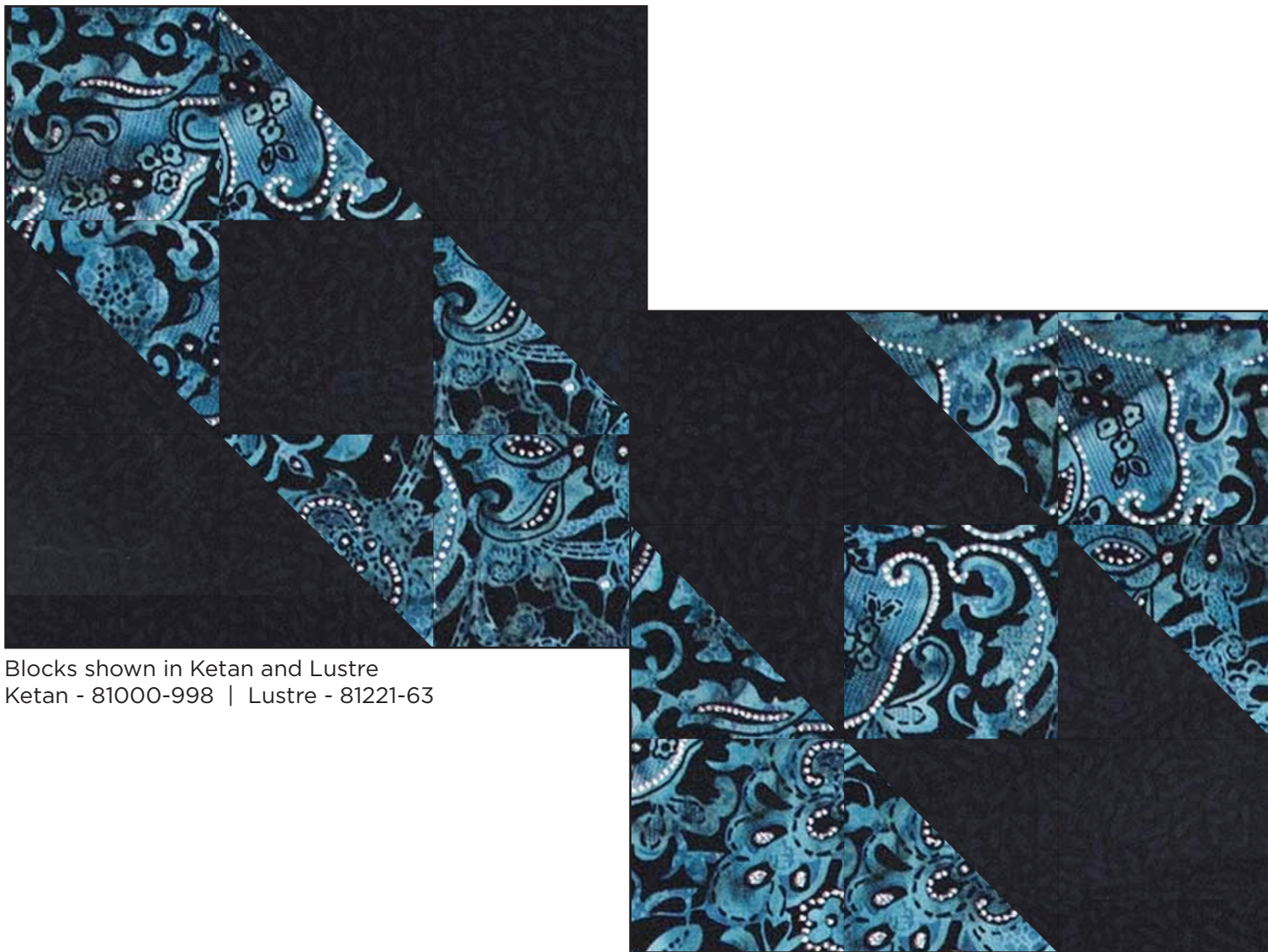
Blocks shown in Ketan and Lustre Ketan - 81000-998 | Lustre - 81221-63