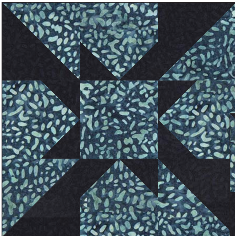
Blocks shown in Ketan 81000-627 | 81000-998