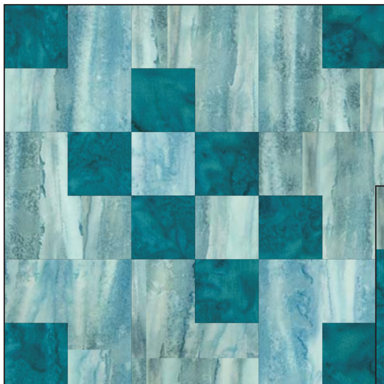
Blocks shown in Brush Strokes and Shadows Brush Strokes - 81230-62 | Shadows - 81300-63