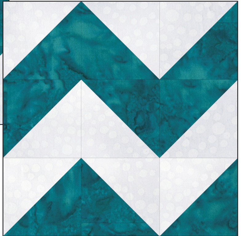
Blocks shown in Banyan Classics & Shadows Banyan Classics - 81205-10 | Shadows - 81300-63