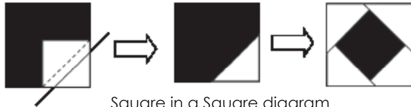
Square in a Square diagram White and Black are reversed in diagram for clarity

Place a 2" square right sides together onto the bottom right corner of the 3 ½" square. Draw a diagonal line from corner to corner as shown. Sew along drawn line. Cut off excess fabric ¼" above seam line. Press the stitched block open. Repeat this process with the other 2" squares on the remaining three corners so that you have a pieced square in a square unit as shown on the Square in a Square Diagram below.