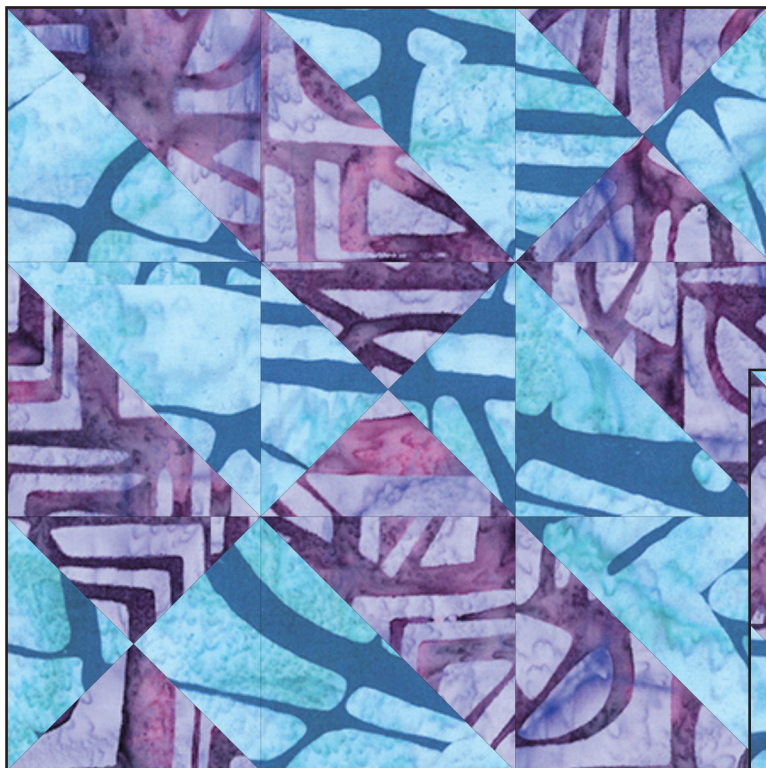
Blocks shown in Tapa Cloth collection 80252-85 | 80256-43