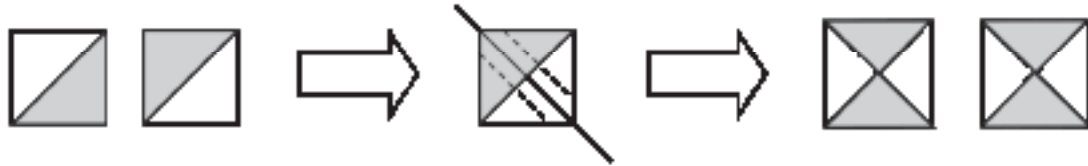
Quarter Square Triangle Diagram (shown in gray to clearly show sewn and cut lines)

Take (2) 4 1/4" squares from fabric #1 and (2) 4 1/4" squares from fabric #2. Place one square of each fabric right sides together and draw a diagonal line on the wrong side of one of the squares. Pin. Stitch a scant 1/4" away from both sides of the drawn line. Cut apart on the drawn line and you have two sewn half square triangle units. On the wrong side of one of the triangle units draw a diagonal line from corner to corner that is perpendicular to the seam line. Layer the two triangle units right sides together, seams aligned, and fabric #1 on top of fabric #2. Sew a scant 1/4" from each side of the drawn line. Cut the squares apart on the drawn line and you have two quarter square triangle units. Repeat to yield a total of four sewn quarter square triangle units. See Quarter Square Triangle Diagram below. There will be one extra unit.