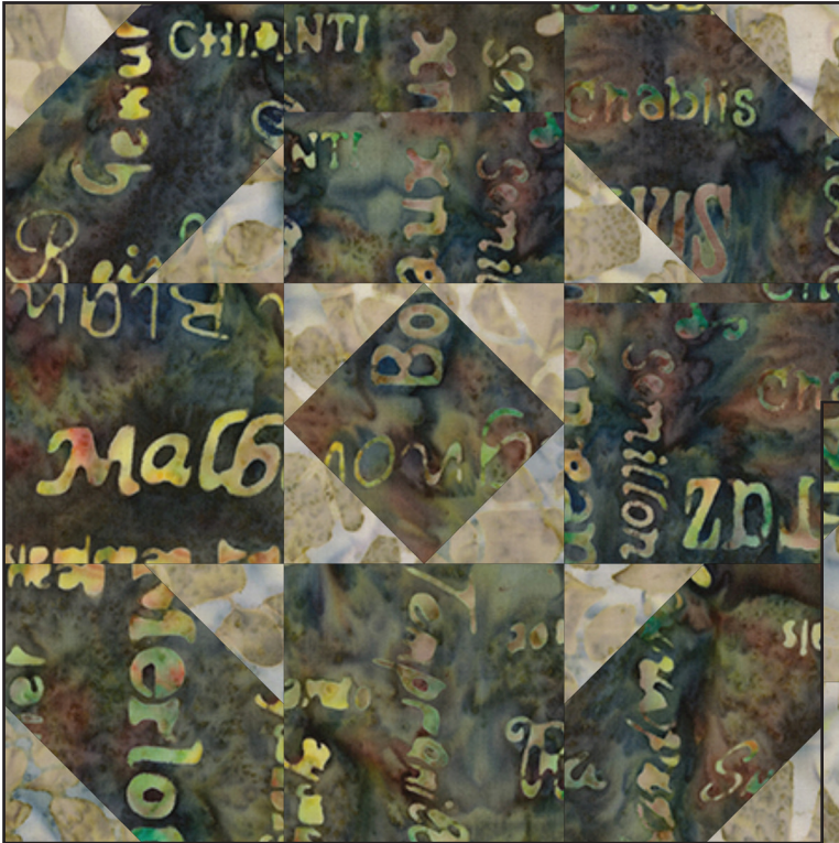
Blocks shown in Vino collection 80223-64 | 80224-35