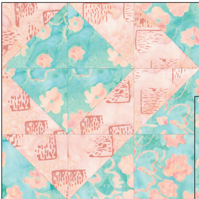
Blocks shown in Patio collection 80380-60 | 80385-56