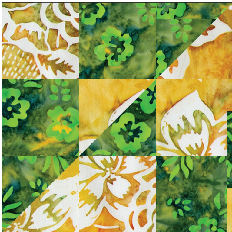
Blocks shown in Baralla Collection 80310-52 | 80314-71