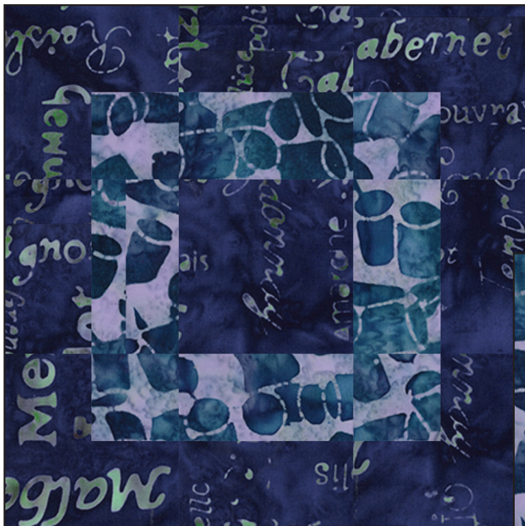
Blocks shown in Vino collection 80223-49 | 80224-44