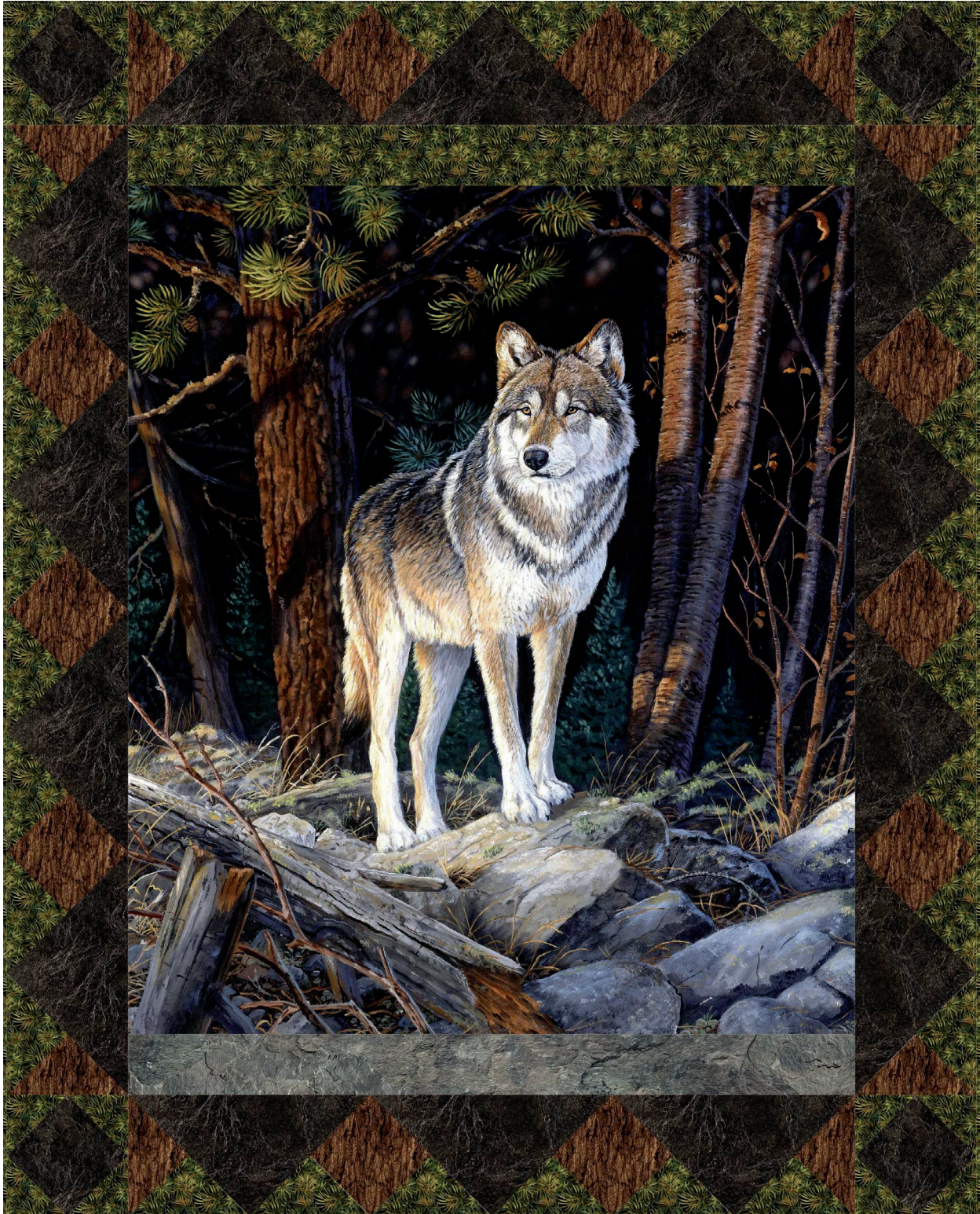
FREE PATTERN • Solitary Sentinel Wall Hanging • 48" x 60" by Elaine Theriault for Northcott