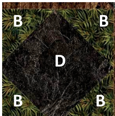
Outer Corner Block

Outer border corner blocks: Cut the 4" squares of Fabric B in half on the diagonal once to yield 16 triangles. Matching up the centers, sew a triangle to opposite sides of a Fabric D – 4 ¾" square. Press away from the center. Sew two triangles to the remaining two sides to get a square within a square. Trim the blocks to 6 ½" Make 4 blocks.