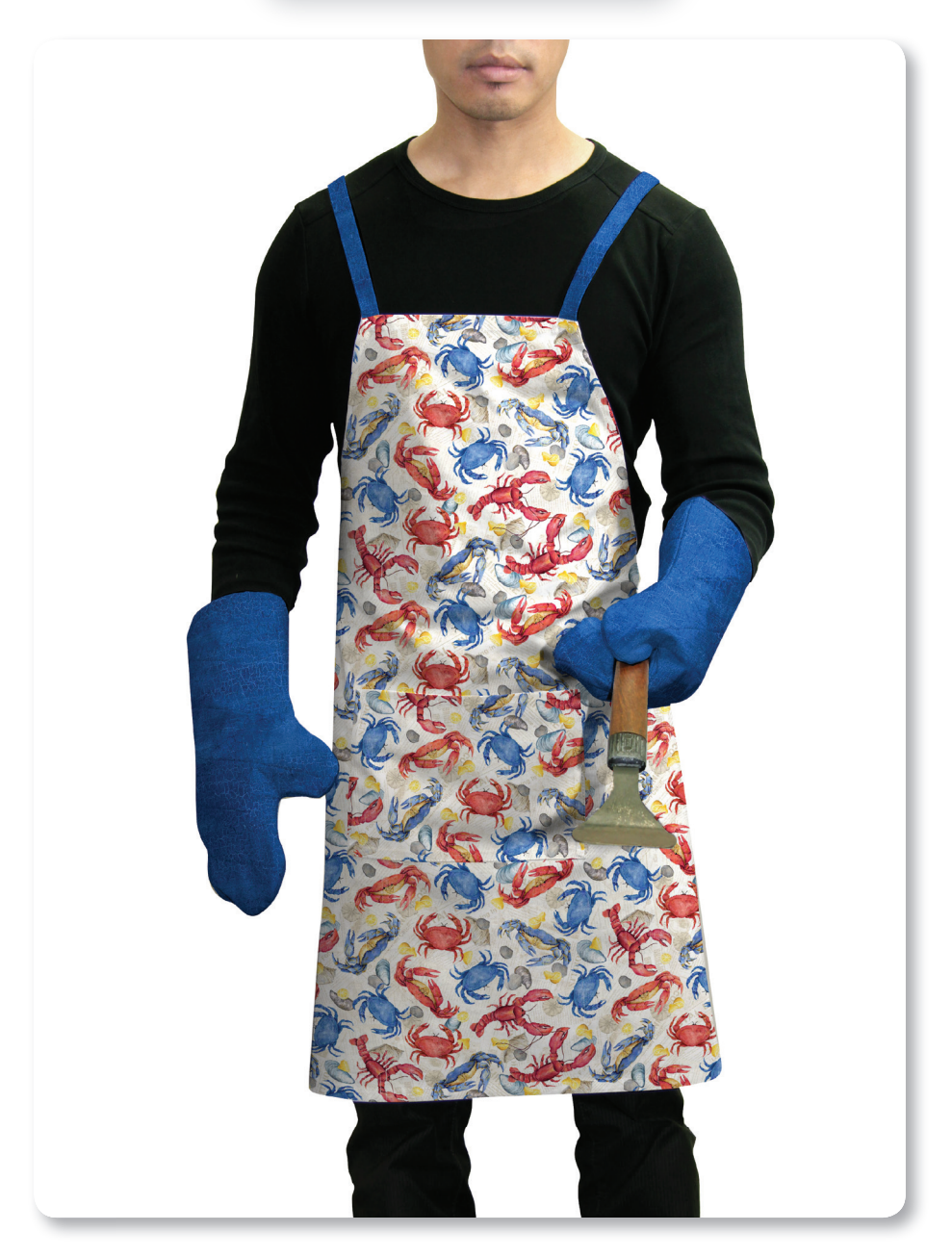
FREE PATTERN • Seafood Shack Apron Set • Approx. 27" wide x 32" long Oven mitts 14" x 8" • by Elaine Theriault