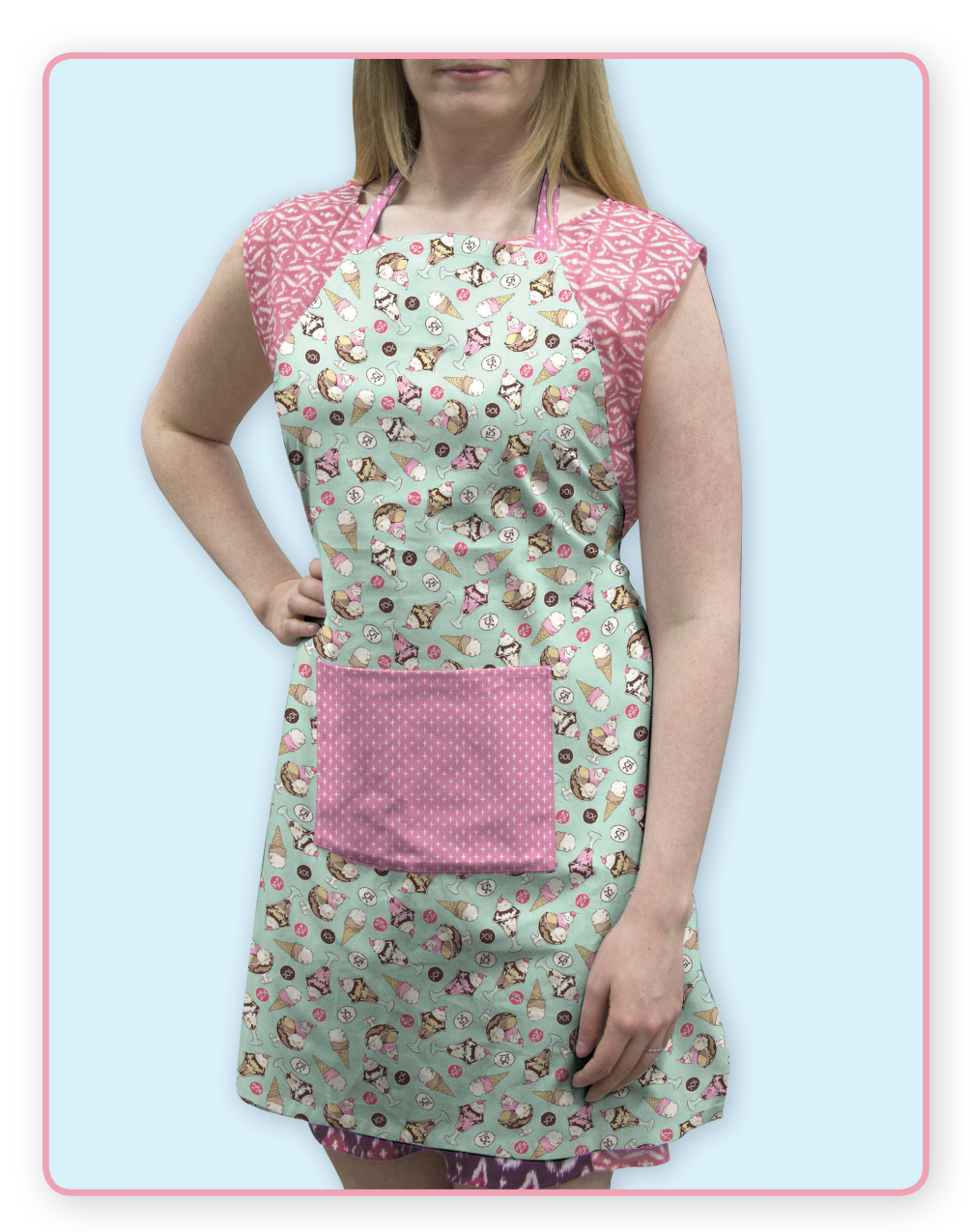
FREE PATTERN • Mel's Diner Apron • Approx. 27" wide x 32" long by Elaine Theriault