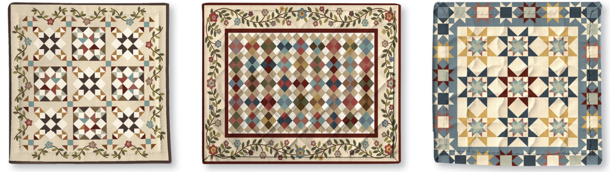
FREE PATTERN • by Elaine Theriault of Northcott

Northcott Canada 101 Courtland Avenue Vaughan, Ontario L4K 3T5