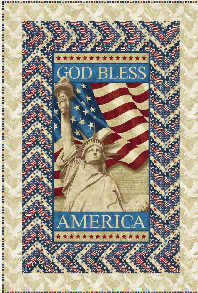
39 1/2" x 58 1/2"