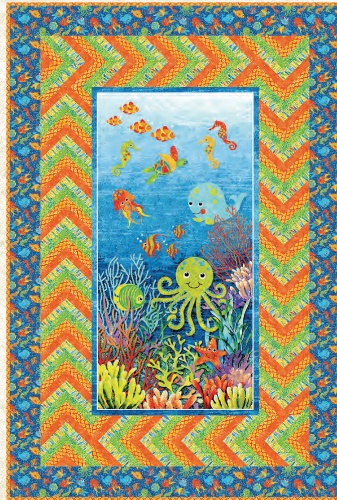
39 1/2" x 58 1/2"