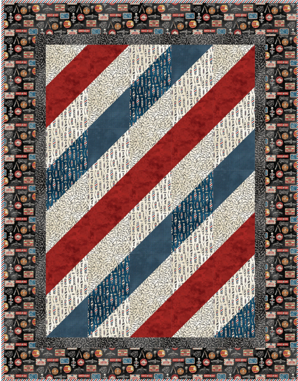
FREE PATTERN • Barbershop Duet • 57" x 73" by Elaine Theriault of Northcott

Northcott Canada 101 Courtland Avenue Vaughan, Ontario L4K 3T5