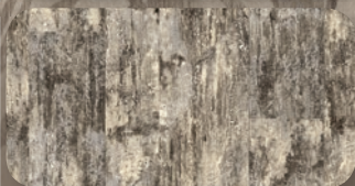
Slate colorway shown

Created by renowned Stonehenge designer, Linda Ludovico, Stonehenge Elements features a wide range of nature inspired textures in two earthy palettes Slate and Blue Planet. The progression of color and value in each palette allows subtle gradations in color. Existing Stonehenge Gradations colors coordinate directly with Stonehenge Elements.