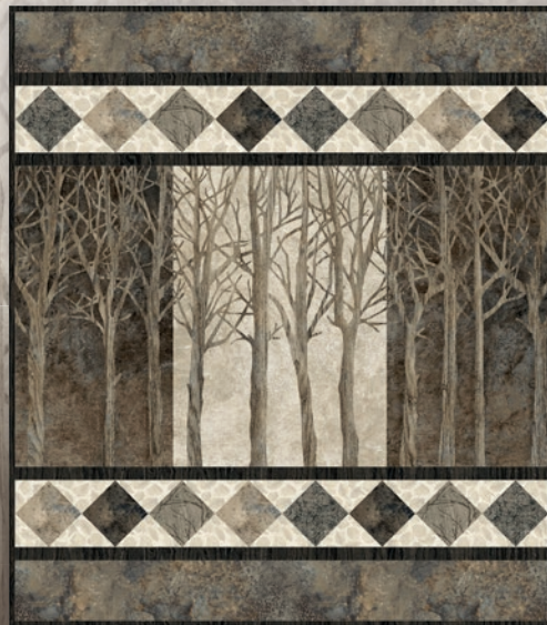
Prelude to Winter • 40" x 46"

Created by renowned Stonehenge designer, Linda Ludovico, Stonehenge Elements features a wide range of nature inspired textures in two earthy palettes Slate and Blue Planet. The progression of color and value in each palette allows subtle gradations in color. Existing Stonehenge Gradations colors coordinate directly with Stonehenge Elements.