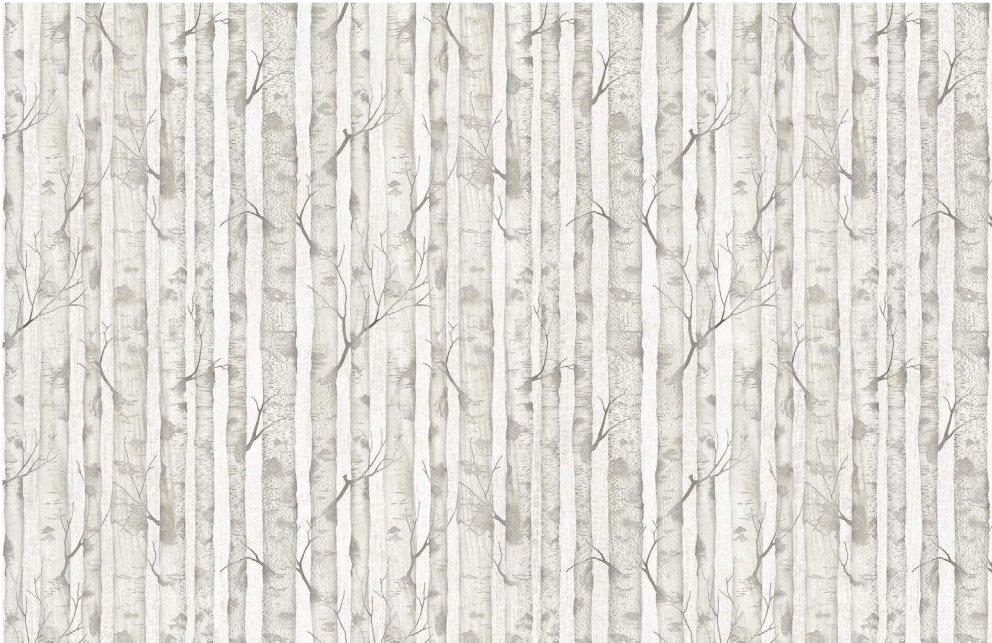
F25013-12 | Birch trees | Beige