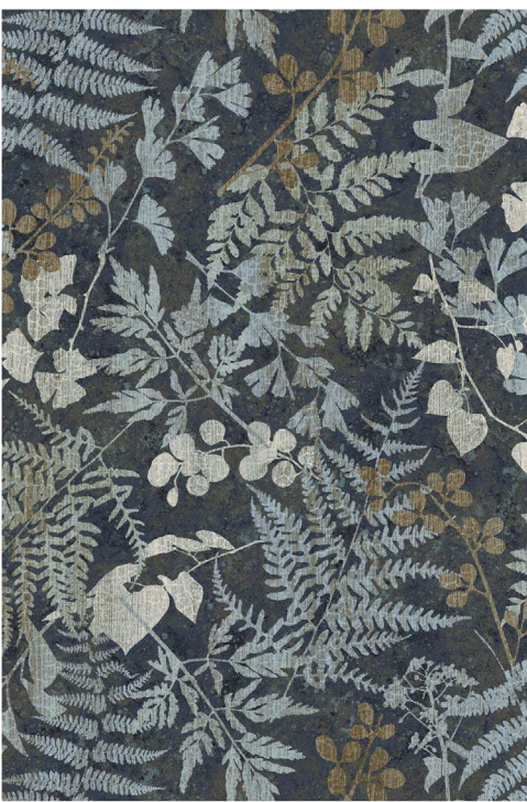
F25008-68 | Leaves | Dark Teal Multi