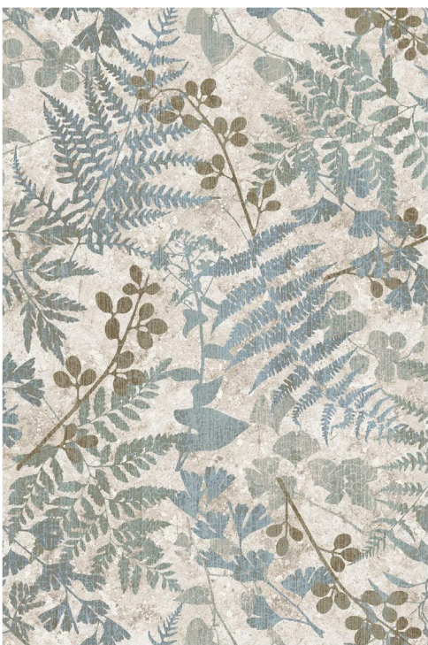
F25008-14 | Leaves | Beige Multi