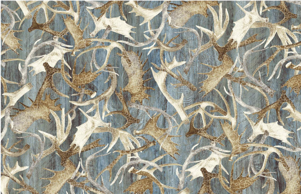
F25009-66 | Antlers | Mid Teal Multi