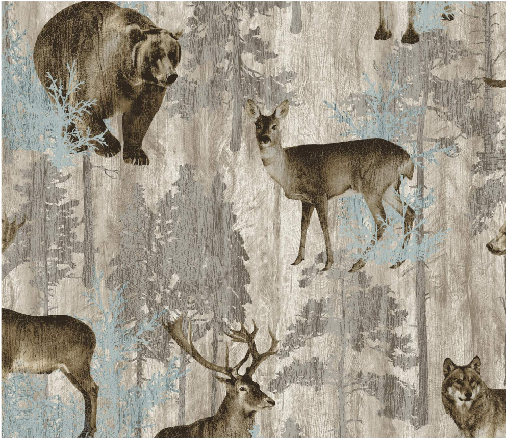
F25007-14 | All-Over Animals | Beige Multi