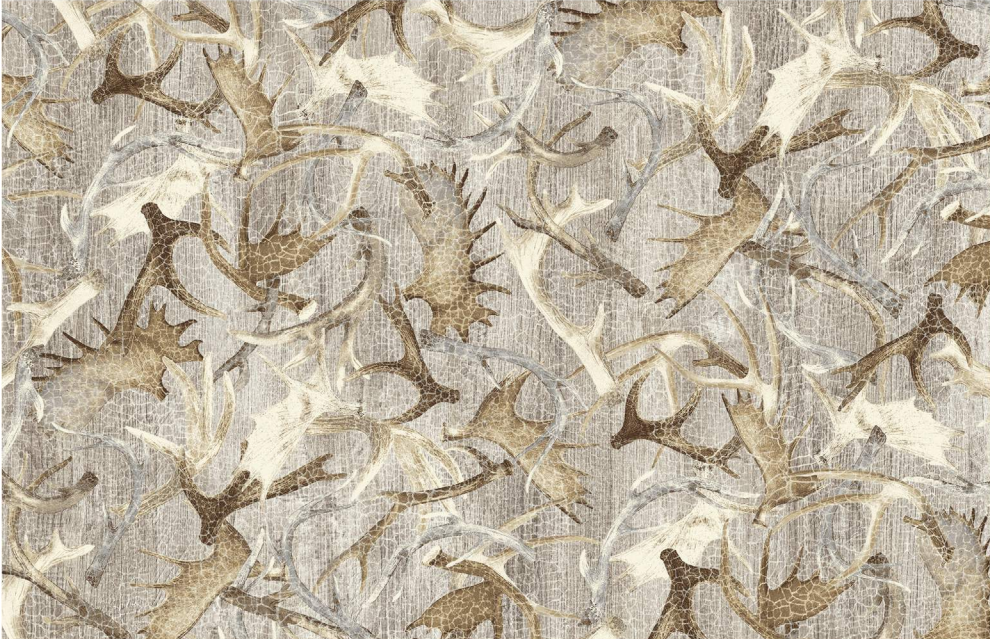
F25009-14 | Antlers | Beige Multi