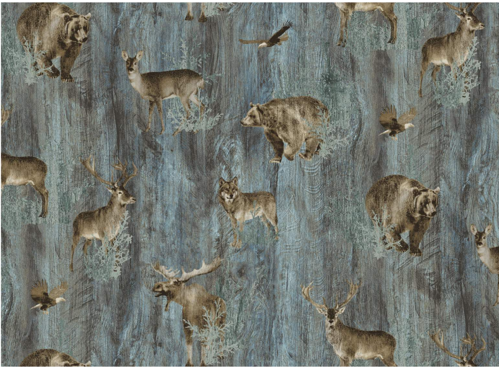
F25016-68 | Small Animal Print | Dark Teal Multi