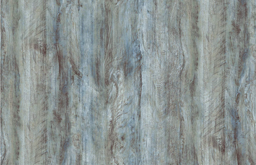
F25010-64 | Colored Wood | Light Teal