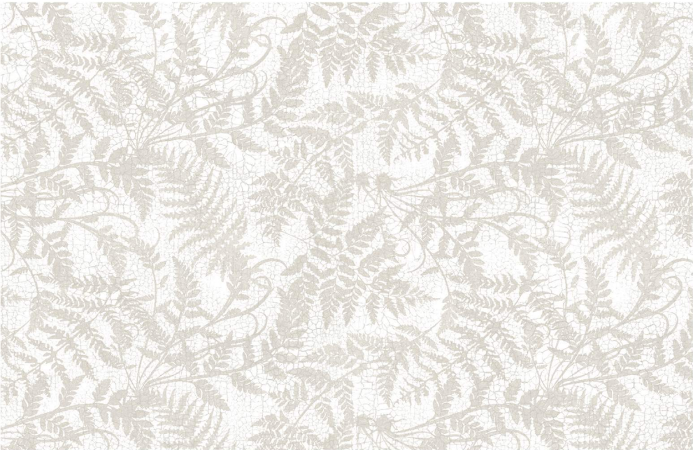
F25014-11 | Tonal Fern | Cream