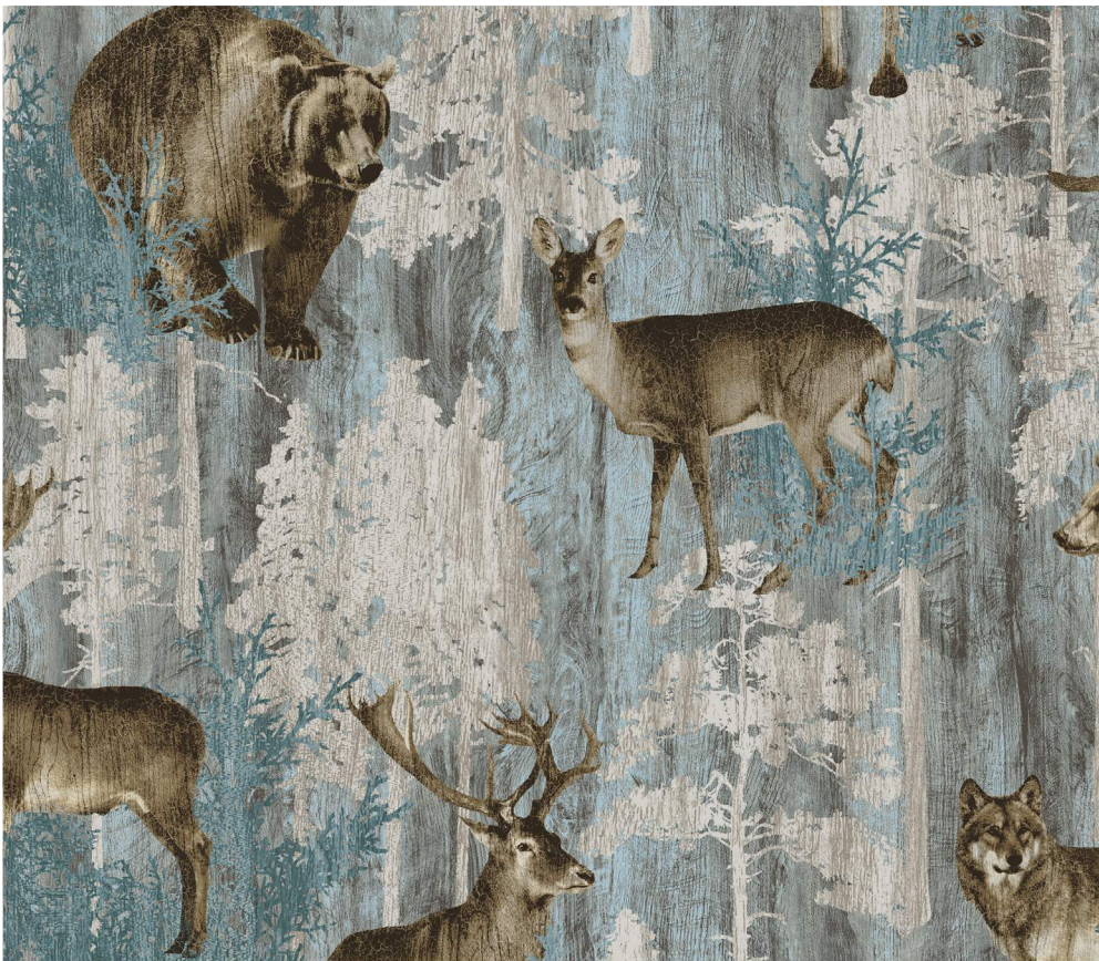
F25007-66 | All-Over Animals | Light Teal Multi