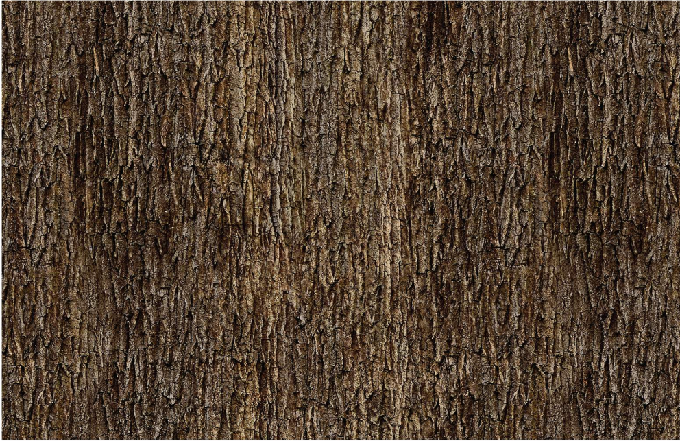
F25015-36 | Bark | Brown