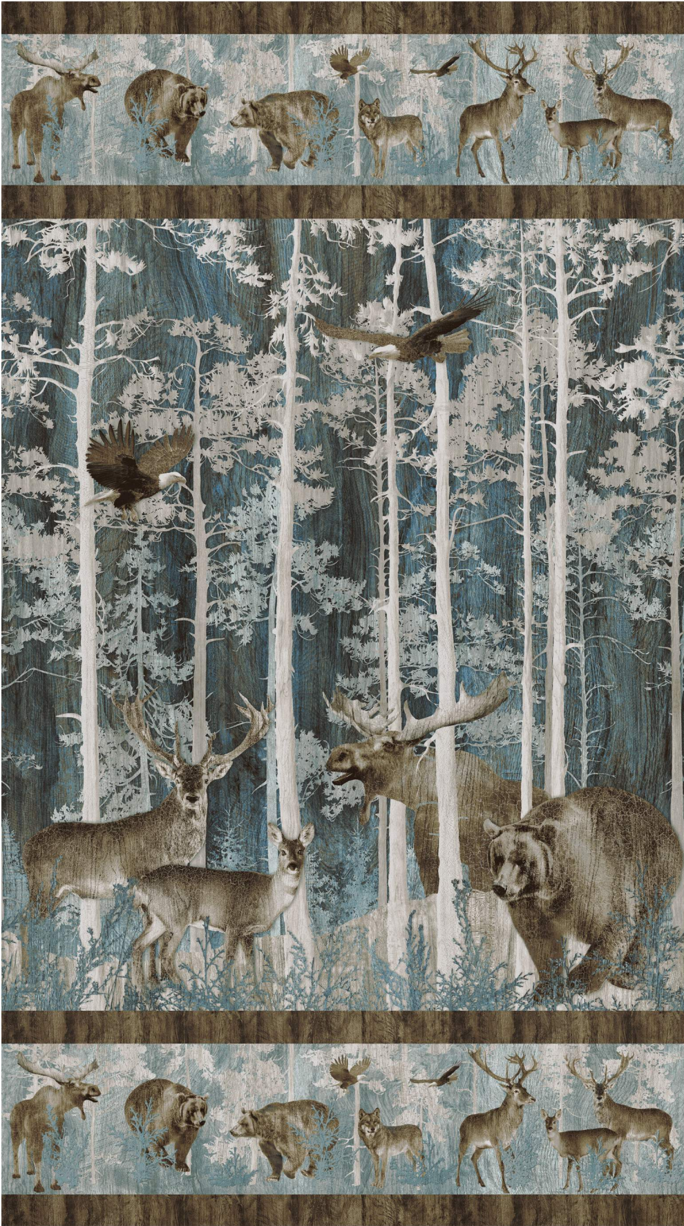
F25006-68 | Full Width Border Stripe | Dark Teal