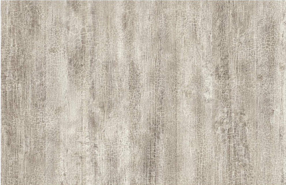
F25011-14 | Whitewashed Wood | Beige