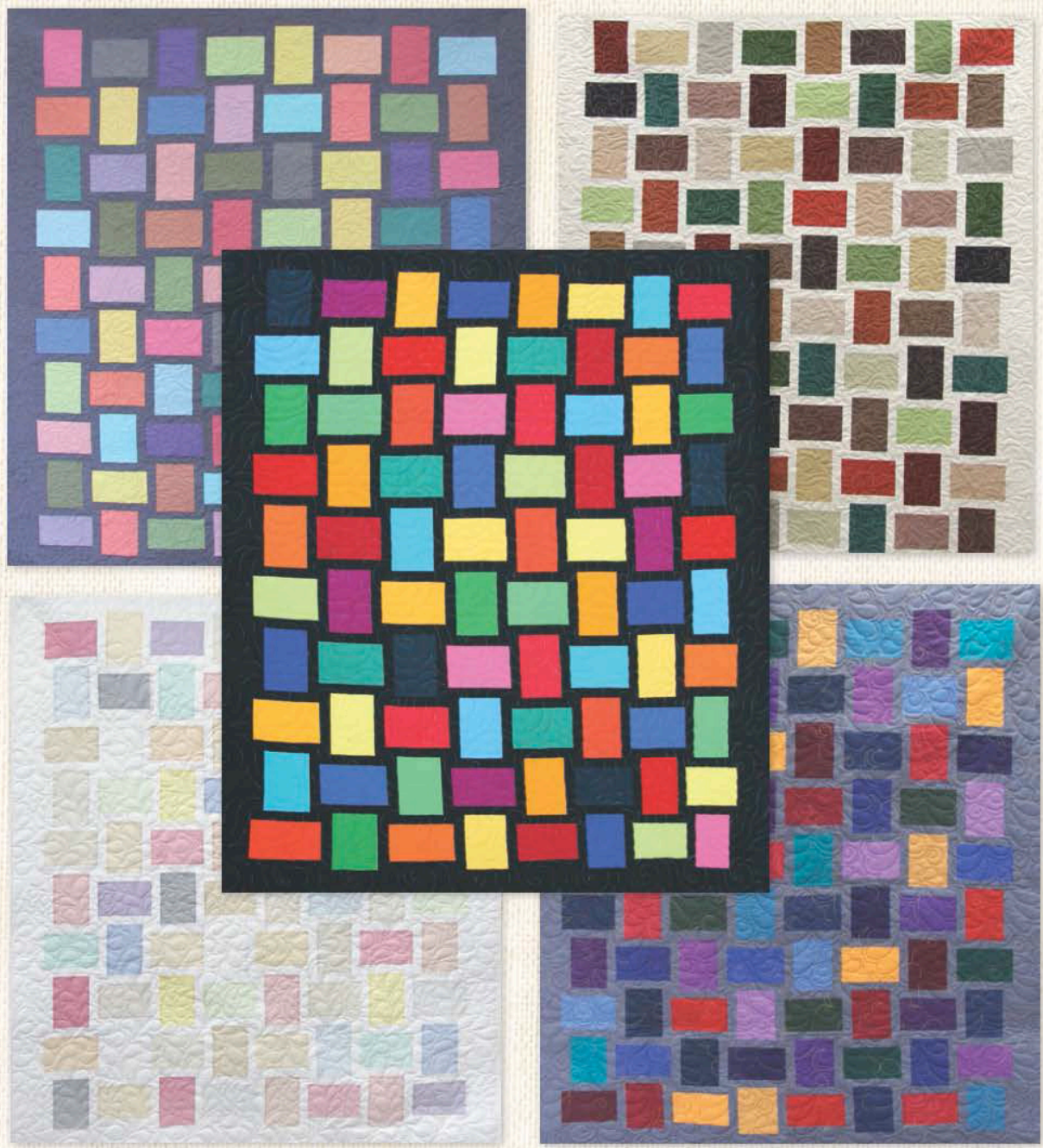
Size 56½" x 68½"