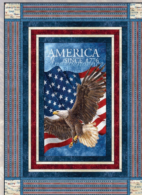
Freedom • 54" x 74" • By Bayou Patch Designs