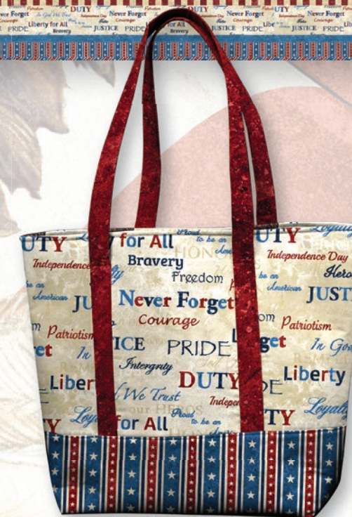
Tourist Tote Bag • 18 1/2" x 12" x 7" • By Sew Many Creations