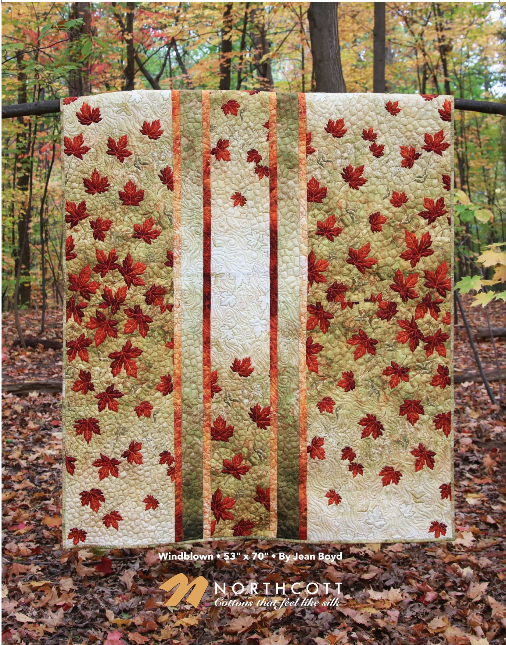
Windblown • 53" x 70" • By Jean Boyd