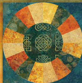
Sample blocks only

Northcott's most popular brand is celebrating 10 years of success, and we want you to celebrate with us by taking part in two exciting contests!