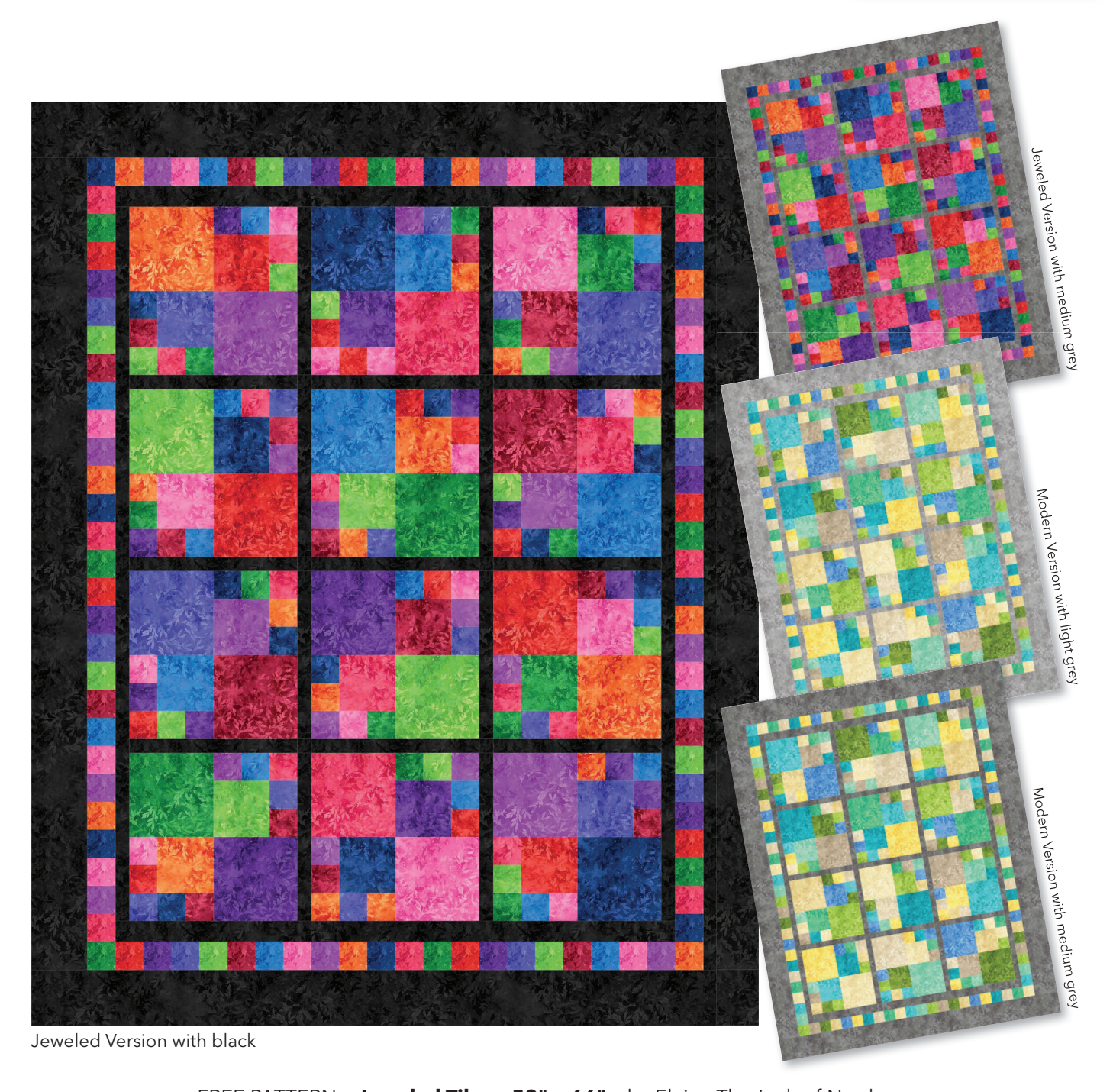
FREE PATTERN • Jeweled Tiles • 52" x 66" • by Elaine Theriault of Northcott